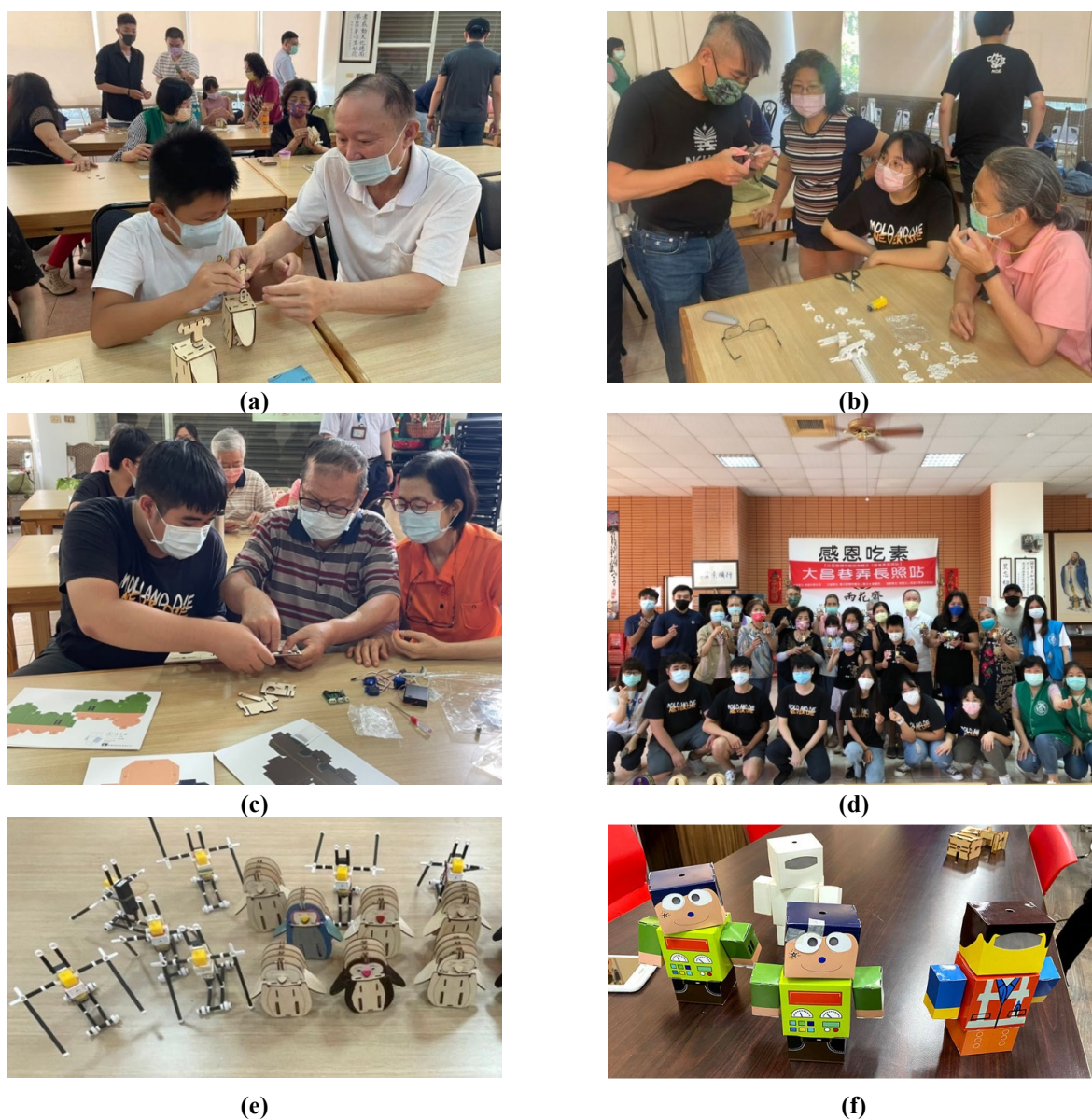
Figure 2. PBL and STEAM Robotics Implementation Course Execution Content: (a) Penguin Bionic Robot Activity. (b) Tumbler pipette robot activity. (c) STEAM paper robot activity. (d) Group photo of grandson, teaching assistant, and medical team. (e) Penguin bionic robot and tumbler straw robot work. (f) STEAM paper robot work.

In terms of curriculum design, there was a difference from the general classroom with a single-teacher teaching method. The course required teaching assistants and medical care teams to assist in the activities. This cross-age teaching assistant team included graduate students, college students, five junior college students, and the professional long-term medical care team of E-Da Chang Hospital. Three STEAM bionic robot practical courses were designed for the elderly at the C base of Changzhao Station in Dachang Lane. The courses included the beginner course on penguin bionic robot assembly, the intermediate course on tumbler straw robot assembly, and the advanced course on STEAM paper robot assembly (Figure 2).