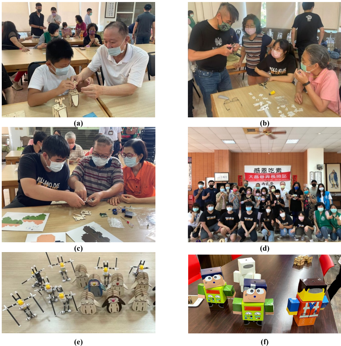
Figure 2. PBL and STEAM Robotics Implementation Course Execution Content: (a) Penguin Bionic Robot Activity. (b) Tumbler pipette robot activity. (c) STEAM paper robot activity. (d) Group photo of grandson, teaching assistant, and medical team. (e) Penguin bionic robot and tumbler straw robot work. (f) STEAM paper robot work.

In terms of curriculum design, there was a difference from the general classroom with a single-teacher teaching method. The course required teaching assistants and medical care teams to assist in the activities. This cross-age teaching assistant team included graduate students, college students, five junior college students, and the professional long-term medical care team of E-Da Chang Hospital. Three STEAM bionic robot practical courses were designed for the elderly at the C base of Changzhao Station in Dachang Lane. The courses included the beginner course on penguin bionic robot assembly, the intermediate course on tumbler straw robot assembly, and the advanced course on STEAM paper robot assembly (Figure 2).