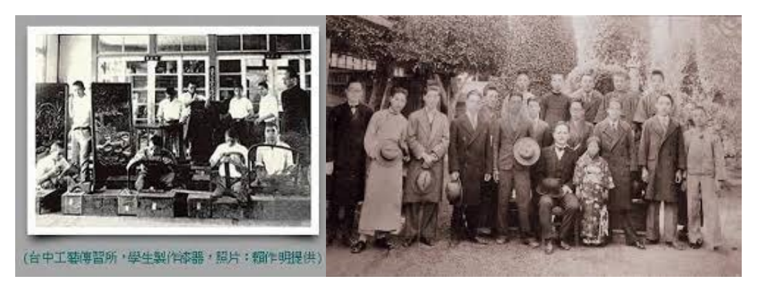
Fig. 2.

In 1914 when the Japanese ruled Taiwan, the Japanese government introduced the Vietnamese species of sumac and planted sumac in Hsinchu Beipu, Miaoli Tongluo, Nantou Puli, and Changhua Bagua Mountain. In 1916, Yamanaka went to Taiwan and established the "Shanzhong Crafts Institute" in Taichung (Fig. 2.)