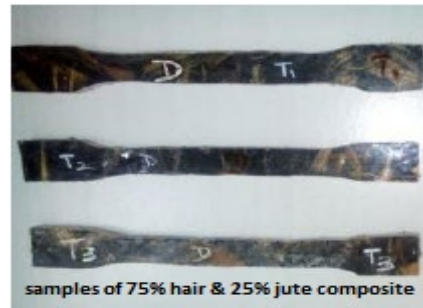
Fig. 3. Hair-jute hybrid composite with 75 percent hair and 25 percent jute

A mold with a flat surface, an activity, or an appositive form made of wood, metal, plastic, or a mixture of these materials. Fiber reinforcement and resin are manually applied to the mold surface. The perform is impregnated with a thermosetting liquid resin before being injected into the mold. The injection is performed using an applied pressure provided by an external source of high pressure or the use of a brush to spread the resin on the fiber before the mold is closed and the needed load is supplied to the mold.