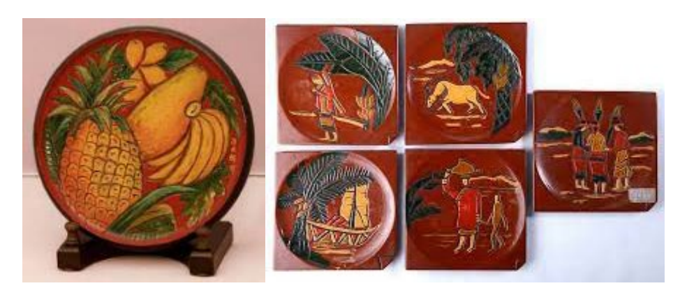
Fig. 1.