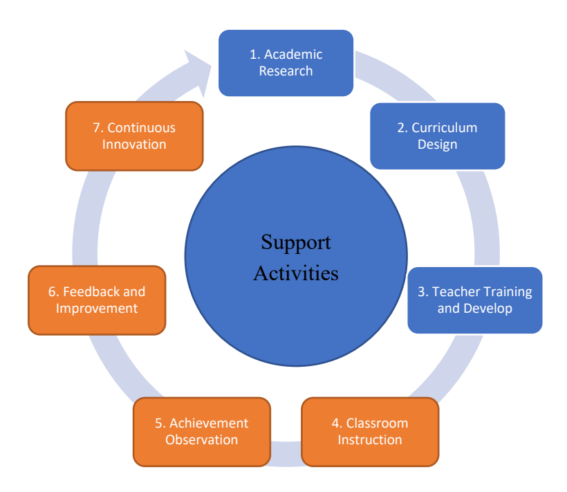
Fig. 2. Sustainable value Chain model in which the value stream is spirally enhanced by the value-added primary activities in each sector and the support activities are centered to provide support for each sector.

In today's fast-changing business environment, boundaries between businesses are no longer just physical. With developed digital technology that delivers various services and information, businesses require a strategic approach to their value chain to overcome the boundaries that may hinder growth and success. One way to achieve this is to identify the primary internal or external activity of the organization to create the value chain in each sector of business. According to a study by Linder and Cantrell (2000), this helps businesses identify the sources of value creation and determine how to allocate resources to maximize value. By focusing on the activities that are most critical to the value chain, businesses can enhance the overall value they deliver to customers.