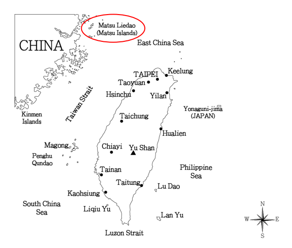
Fig. 1. Location of Matsu Islands.

The Mini Three Links policy has not improved the average residential income level nor has it demonstrably changed the economy, population, and per capita income. Aging and a low birth rate are two critical issues facing the tourism industry in Matsu Islands. It is particularly important to shape an international sightseeing environment to capture profits from the more than 1,000 foreign visitors per year to Matsu Islands. In addition to local culture, Matsu Islands possess abundant ecological wonders such as the mysterious "Blue Tears", or sparkling blue light which is spotted along the shore in Matsu Islands. In addition, there are endangered species such as the Chinese Crested Tern ( Thalasseus bernsteini ) (Matsu National Science Area, 2019). The village has ancient architectural structures influenced by builders from the eastern part of Fujian. There are culinary delicacies of special to Matsu, Taoist temples, and a variety of religious-centered activities such as the worship of Mazu (a Chinese Sea Goddess) (Matsu National Science Area, 2019). These are important tourist attractions on the Matsu Islands. In addition to tours, young people, especially from western countries travel around Matsu Islands alone or in groups. Therefore, the region needs to be internationalized by implementing smart tours, self-guided sightseeing, and mobile payment facilities. The tourist industry must develop in a way that is sustainable for the local environment.