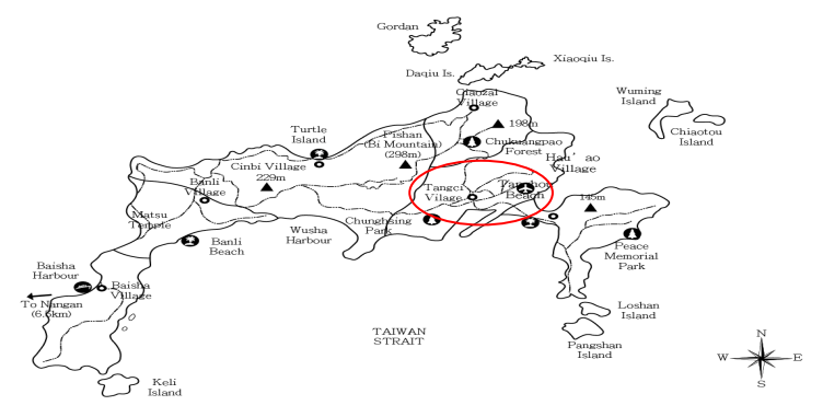
Fig. 2. Location of Tangci Village in Beigan Township.

TW University has abundant internationalization capabilities, cross-disciplinary design talents, and talent cultivation experience, plus a branch campus in Matsu. Company T specializes in digital technology and mobile payment and has been engaged in Matsu civic planning for many years. To efficiently combine resources, the research team of University TW opted to conduct industry-academia collaboration with Company T.