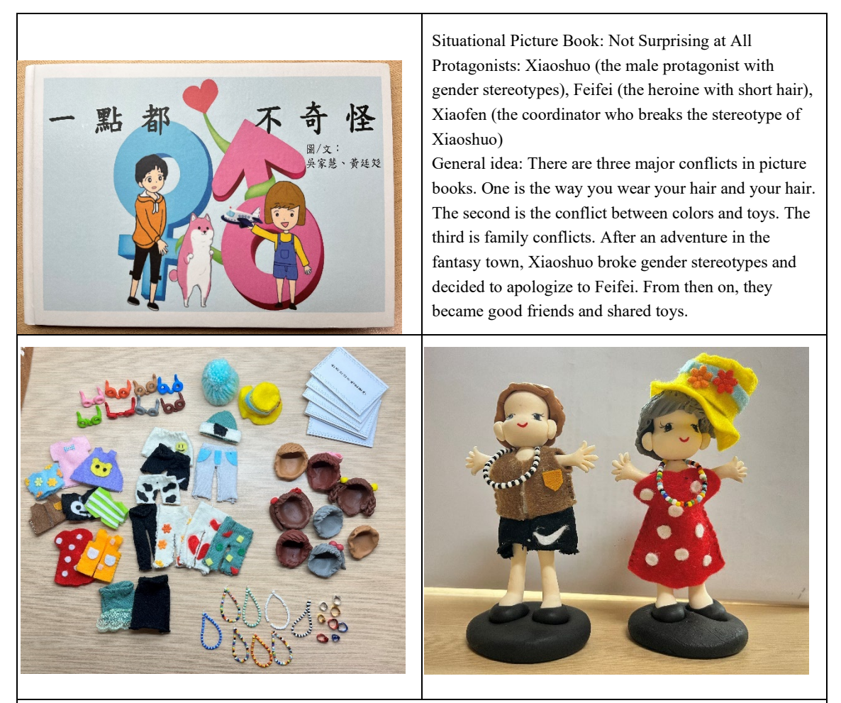
Table 1. Finished picture and gameplay introduction of "Teaching Aids and Situational Picture Books for Gender Equality for Young Children".

The first level: Let's dress up together.