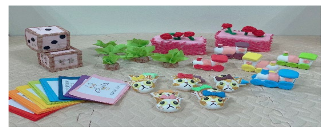
Fig. 5. Anti-epidemic magic castle accessories.