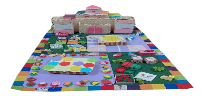
Fig. 6. Anti-epidemic magic castle set up.