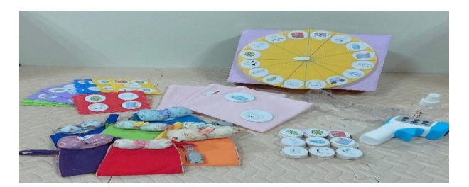
Fig. 3. Anti-epidemic vanguard accessories.