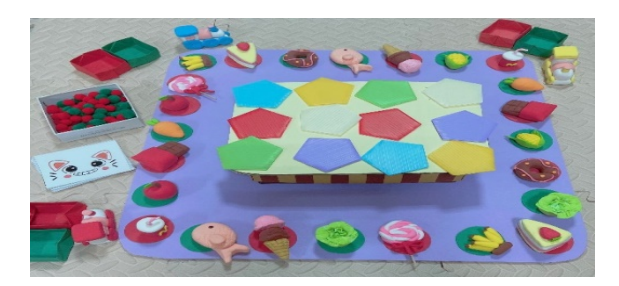
Fig. 2. Diet traffic lights set up.