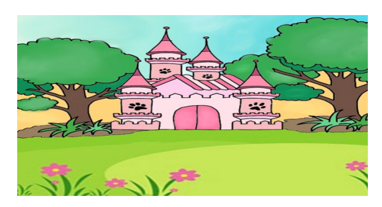
Fig. 7. Picture book cover: Anti-epidemic Magic Castle.

Generally, teaching aids are accompanied by "instructions", but the instructions are only simple text descriptions, which are not practical for young children. Therefore, with their tutors' help, we developed an "epidemic prevention picture book". Starting with interesting stories, children were guided to correct handwashing steps, wear masks, and diet and epidemic prevention knowledge to improve their immunity. Children could learn knowledge from picture books and play games with teaching aids as learning and teaching complement each other.