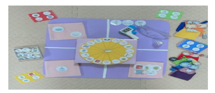
Fig. 4. Anti-epidemic vanguard set up.