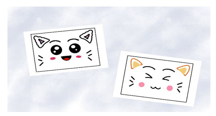
Fig. 9. Creative mask stickers.

We developed anti-epidemic objects, namely "creative mask stickers" (see Fig. 9) and "mask portable storage bag" (See Fig. 10). "Creative Mask Stickers" was composed of small animal-shaped stickers such as small eyes, mouths, and ears which could be attached to masks to increase children's interest and willingness to wear them. The "Mask Carrying Bag" allowed children to store masks and avoid losing them after use.