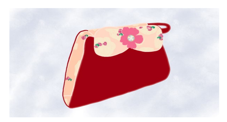
Fig. 10. Mask portable storage bag.