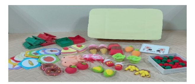
Fig. 1. Diet traffic lights accessories.