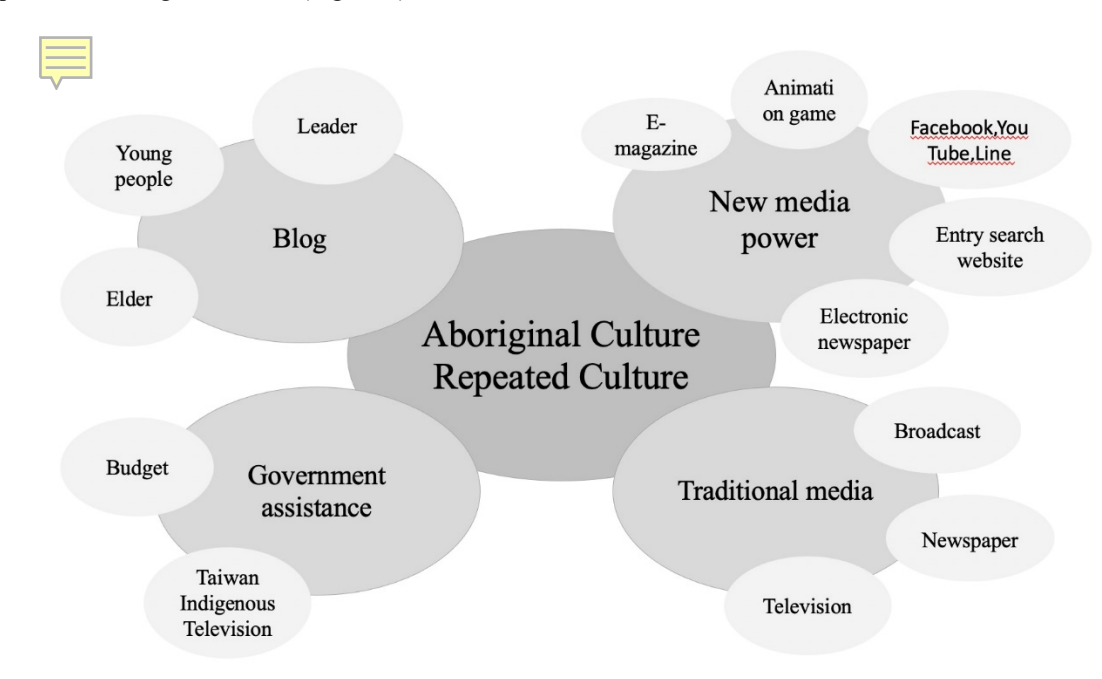
Fig.2. Requirements to revive the aboriginal culture.

Based on the above analysis, the gradual extinction of Taiwanese aboriginal culture can be prevented at the following four levels. First, the tribal consensus of tribal elders, leaders, and young people is required for cultural revival, and government assistance is needed for budget support and aboriginal television support. Second, traditional media reports using radio, newspapers, and television are necessary to produce special topics about aboriginal traditional culture to attract public attention. Finally, the power of new media is required for rapid and instant communication through social media. From small groups with mobile phones to mass communication, Internet search portals, electronic news, online animation games, and online electronic magazines are necessary to combine the applicability and convenience of new media. Then, the spirit and meaning of traditional aboriginal culture will be shared through new media networks so that more people can understand the aboriginal culture better. The revival of the culture is not only the responsibility of the aboriginal people but requires the government's budget and the support of the people to preserve and spread the aboriginal culture (Figure 2).